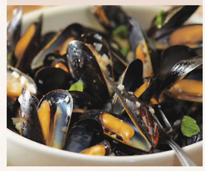
PRICES DO NOT INCLUDE APPLICABLE TAXES

P.E.I. mussels steamed in white wine with basil, garlic, diced tomatoes, and extra virgin olive oil. Served with our own breadsticks. 15.99